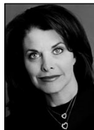
Sherry L. Lansing The Sherry Lansing Foundation 2121 Avenue of the Stars, Suite 2020 Century City, CA 90067 (310) 788-0057 FAX: (310) 788-0631 Appointed by Gov. Gray Davis in 1999; term expires 2010